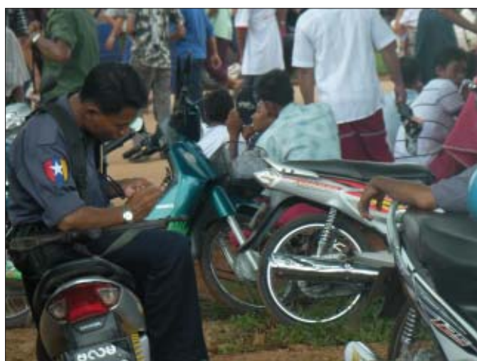
A Mon State policeman is on duty at a public ceremony, in Mudon Township, Mon State.

According to HURFOM's field reporter, in the beginning of January 2010 the military government in Naypyidaw ordered Brigadier General That Naing Win, chairman of the South East Command (SEC), to ensure that all Light Infantry Battalions (LIB) and Infantry Battalions (IB) in Mon State be ready to maintain security in preparation for the 2010 election. Among the security measures demanded by the Burmese government was the implementation of rigorous check-points, and increased travel restrictions on travelers moving around rural areas, or between rural area and urban sites.