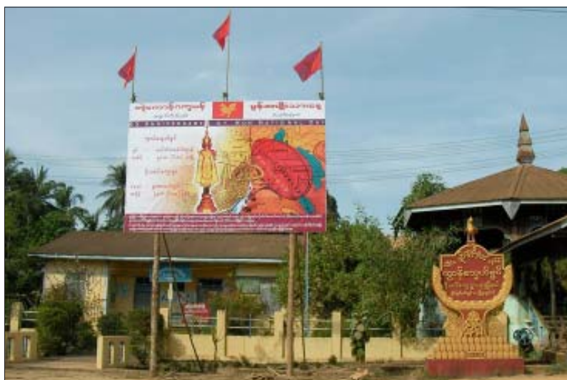
A 63rd Mon National Day poster is seen at Hnee Padaw village, Mudon Township, in Mon State.

“We obliterated the Burmese language as they ordered it last week, but we reported the agenda of Mon National Day, to ask about the speech in the Mon National Day ceremony”, a committee member in Mudon Town explained to IMNA last week.