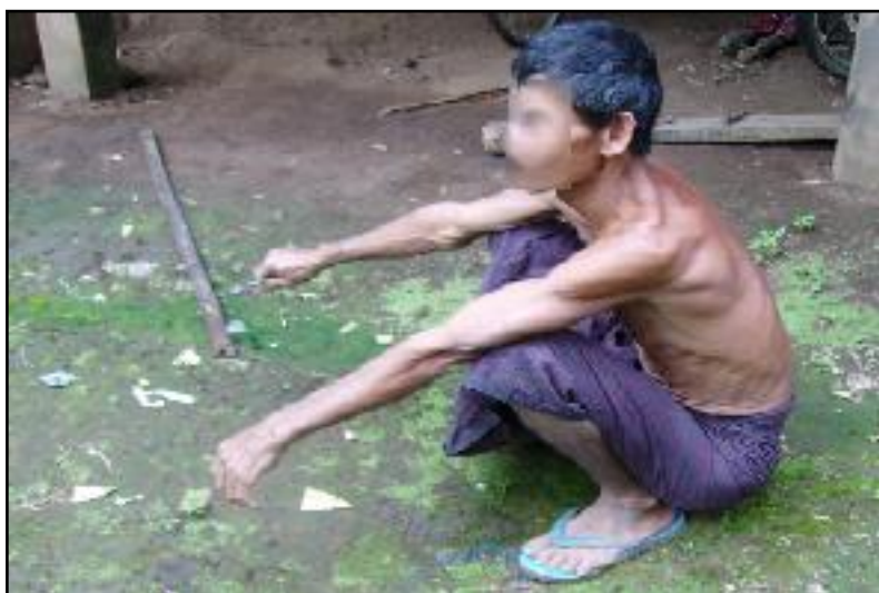
A villager from Bay Lamine village describes his experiences being used as unpaid labor by LIB No. 106 in northern Ye Township, Mon State

In the most recent pipeline rupture in Taung Pon village, the gas ignited and villagers described to a HURFOM field reporter how a huge flame that shot into the sky and burned for 2 and a half hours.