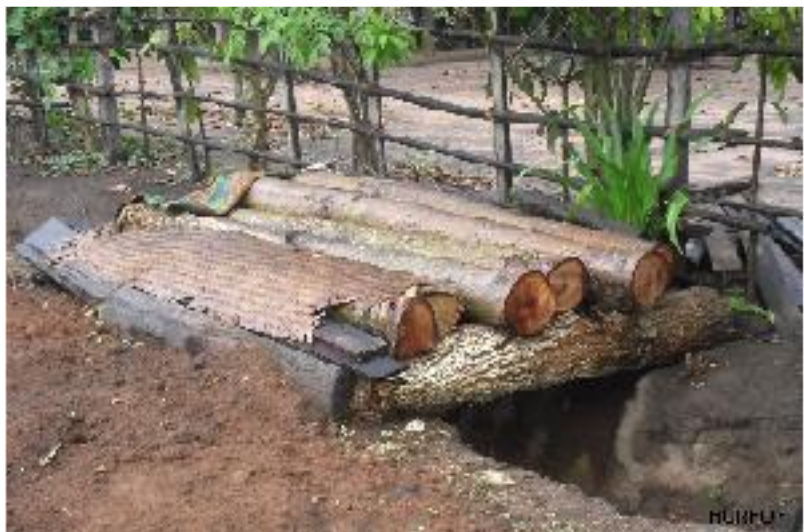
A bomb shelter is seen in Anan Kwin village, Karen State

Bomb Shelter Since the early of this May, villagers in Anan Kwin village, Three Pagoda sub-township, Kyainnseikyi Township, Karen State, had been building homemade bomb shelters, or locally called "cover-holes" (Kar Bar Kyin in Burmese). HURFOM's field reporter has found that nearly every household at this point has dug a bomb-shelter. However, according to the information from locals, unidentified battalion officers from Tactical Command (TC) No. 2 based in Anan Kwin operating under South East Command (SEC), have ordered villagers to stop build