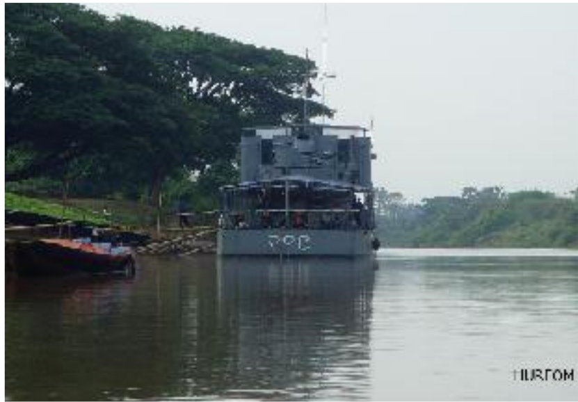
ASPDC Navy checkpoint is seen on the Zemi river, Kyainnsekiyi Township, Karen State

The Zami river route is used widely by merchants and locals to import cooking oil containers from Thailand