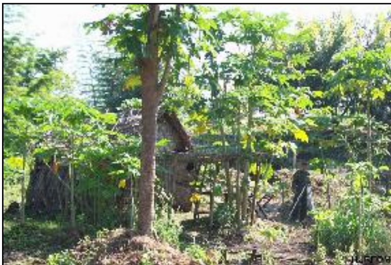
A security guard shack is seen in a villager's field near the gas pipeline, under the command of LIB No. 588 which is based near Taung Pon village, northern Ye, Mon State

Villagers, regardless of their relation to or innocence in an explosion, inevitably face abuses by soldiers through forced portering and labor, guard duty and extortion of fees. Local battalions often issue orders to communities requiring locals to stand guard for 24 hr rotating shifts for sections of the pipeline. After a breach residents are forced to pay a “repair” cost ostensibly to cover supplies and labor for the work. However these costs are