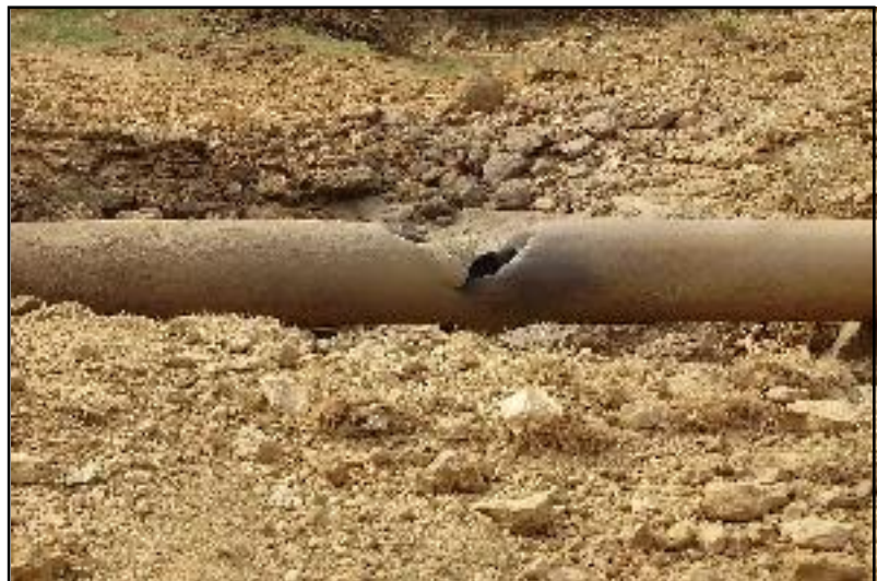
A portion of the Kanbawk to Myaing Kalay natural gas pipeline is seen exposed after a rupture near Lamine Sub-township, Ye Township, Mon State

HURFOM has focused this report on the villages of Taung Pon in Ye Township and Kwan Hla village in Mudon Township due to the high rate of ruptures and explosions within their domains. As a result of these pipeline disruptions village residents have faced an increase in abuses ranging from extortion of repair and security costs, to forced labor, to arbitrary arrest, and travel restrictions. In addition to abuses from local battalions, these communities must face the impacts escaping gas has on residents’ health and the local environment.