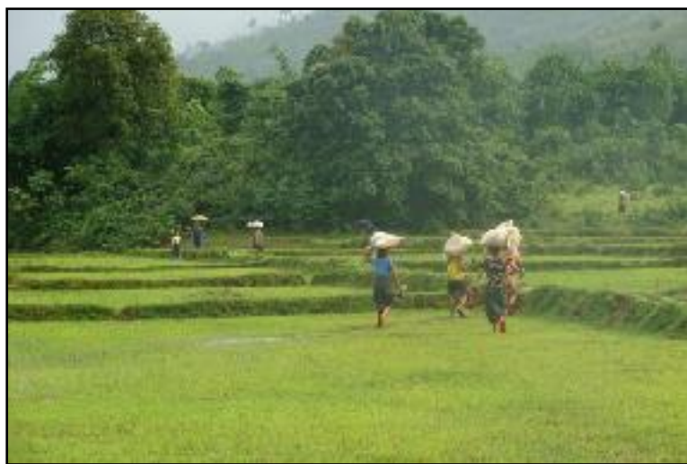
Paddy farmers are seen in their fields close to the Kanbauk to Myingkaay natural gas pipeline in northern Ye Township, Mon State

On June 3 rd , even though the local troops, the civilian security groups and the government authorities have yet to respond to the villagers by giving any reaction or punishment, a major from LIB No. 62, a local