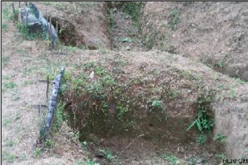
These trenches were dug by local residents through their farmland, who forced to work by LIB No. 343 near Ayu-Taung village, Ye Township, Mon State

No.] 343 comes to the village they take chickens and ducks... We, the villagers, have to pay for that fee. It is around more than 4,000 kyat a month. Last month we had to pay for 6 Patetar of pork (Burmese weight, 1 patetar = 1.5 Kg), as demanded by Sergeant Maung Pyone [known by locals as Saya Gyi]. Every household has to pay bite by bite gradually, but it is around 4,000 to 5,000 kyat a month. This amount is not included for pipeline security