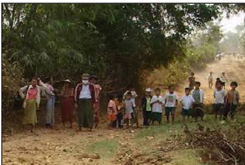
Some villagers are seen wearing masks to avoid breathing gas after the last natural gas pipeline rupture in Lamine Sub-township, Mon State

As noted above, ruptures and explosions are often large volumes of gas that will vent from pipelines, sometimes for months on end without any effort to make repairs. Villagers have little to no option to avoid noxious fumes, as they must continue to work for their survival and live in the presence of the fumes. As most incomes are derived from farming and day labor, villager's work is inexorably connected to the stability of the local environment.